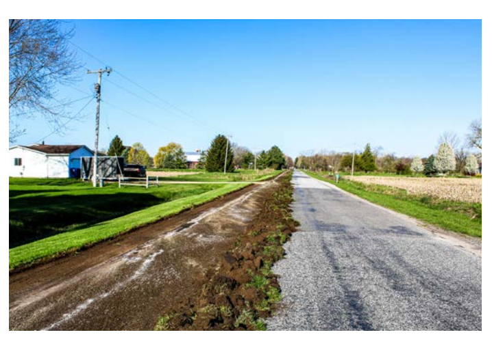
Volkmer Rd (Gasper & Corunna) - Chesaning Twp High Shoulder Removal