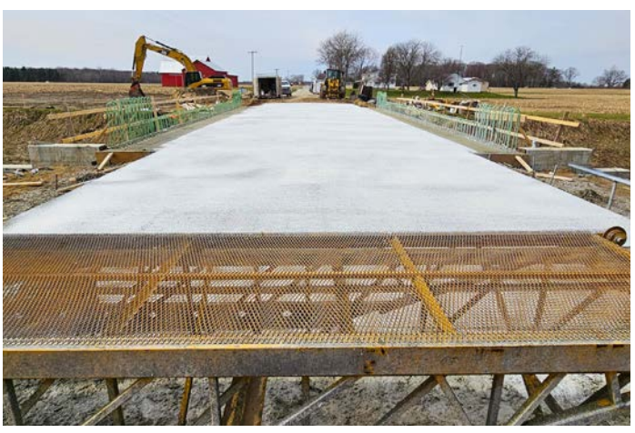
Burt Rd (Over Pine Run) - Taymouth Twp Federally Funded Bridge Project