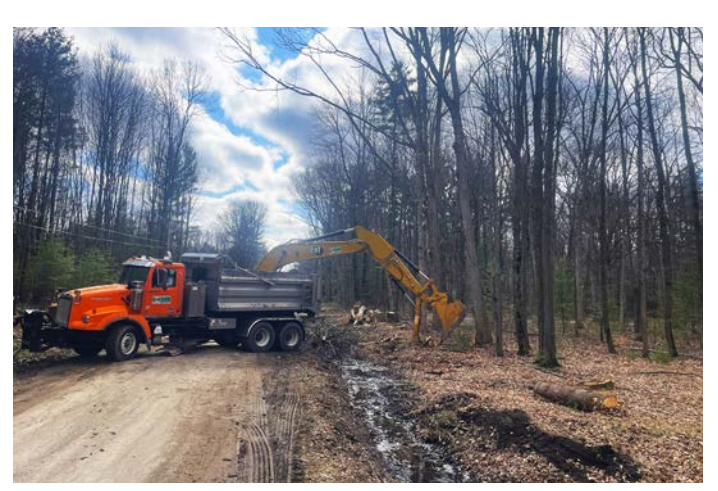
Bell Rd (Birch Run & Burt) - Taymouth Twp Tree Cutting & Trimming