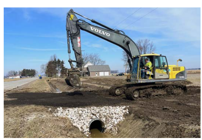
Corunna Rd (Ditch & Johnstone) - Chesaning Twp Ditching & Culvert Replacement