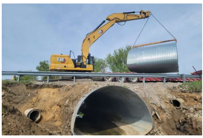
Orr Rd (North of Geddes) - Thomas / Richland Twp Culvert Replacement