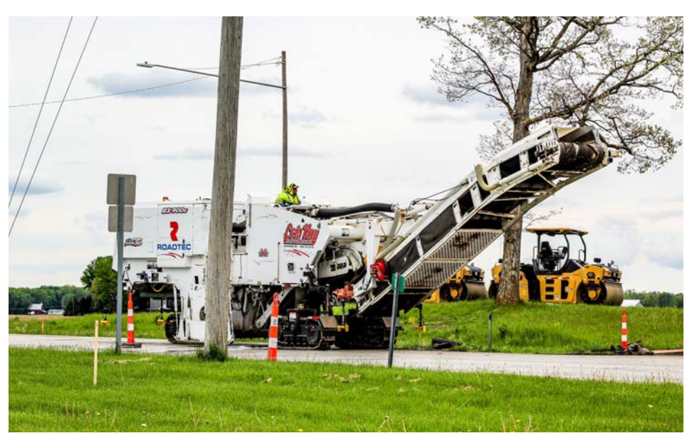
Dixie Hwy Construction