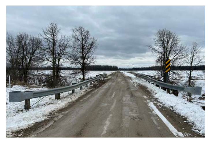
Meridian Rd Bridge - Lakefield Twp Guardrail Replacement